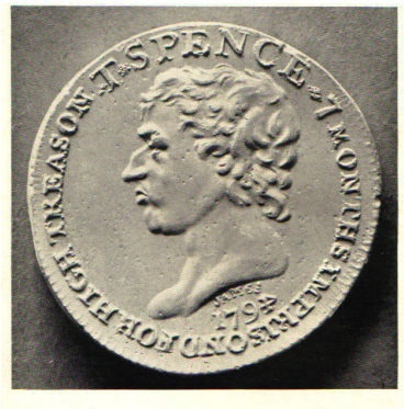
Figure: Thomas Spence (1750–1814), the leading English revolutionary of his day; advocated common ownership of land, freedom of the press, and children’s rights

Some late-18th-century British revolutionaries