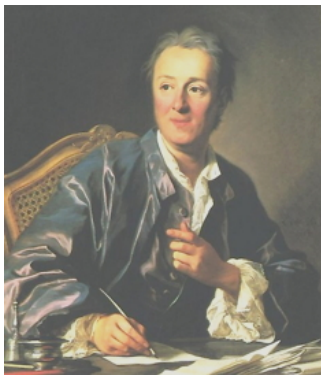
Figure: Thomas Aikenhead (c. March 1676 – 8 January 1697), medical student in Edinburgh, the last person to be executed for blasphemy in Britain