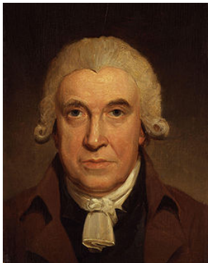
Figure: James Watt (1736–1819), Scottish (re-) inventor of the steam engine

Some late-18th-century British revolutionaries