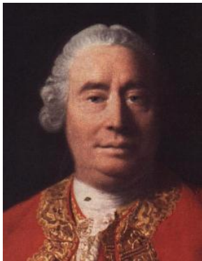
Figure: David Hume (1711–1776), essayist, economist, historian and philosopher of the Scottish Enlightenment, advocate of empiricism and skepticism; Immanuel Kant claimed that it was Hume who had wakened him from the ‘slumber’ of ‘dogmatic’ metaphysics and set him on the path toward critical philosophy