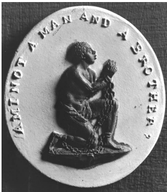
Figure: “Am I not a man and a brother?” – a porcelain brooch mass-produced by the Wedgwood family and worn by supporters of the anti-slavery movement. A judgement by Lord Mansfield in 1772 established that any slave who set foot on the soil of Great Britain automatically became free. The Slavery Abolition Act 1833 abolished slavery throughout the British Empire.