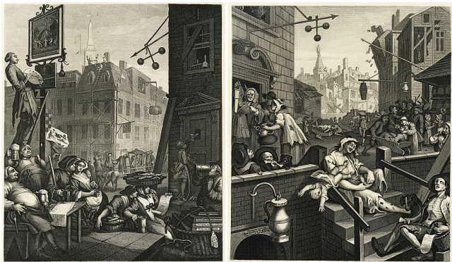
Figure: William Hogarth: Beer Street (L) vs Gin Lane (R), 1750-1751. Intended to show the evils of drinking gin, rather than good old English beer.

Some late-18th-century British revolutionaries