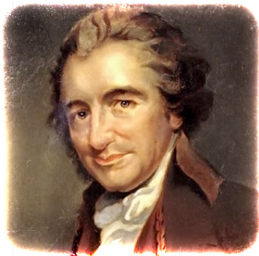
Figure: Thomas Paine (1737–1809), English writer and revolutionary; central instigator of the American Revolution; member of the French Convention nationale ; “Without the pen of the author of Common Sense , the sword of Washington would have been raised in vain.” – John Adams, 2nd president of the United States