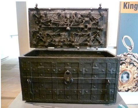
Figure: The Darien Chest, which contained the documents and money of the Company of Scotland for the Darien Scheme (1698–1700)

Some late-18th-century British revolutionaries