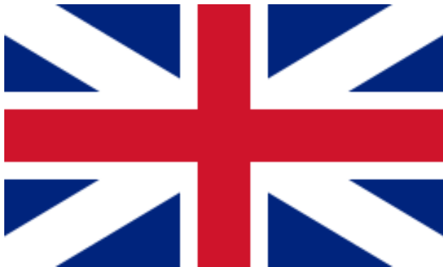
Figure: Union Flag, initially used by English and Scottish ships at sea (1603[+3]–1707) and then later as the flag of the Kingdom of Great Britain (1707–1801) after the Acts of Union (1707)

Some late-18th-century British revolutionaries